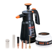
MAX WeldClean Starter Kit, small

Optional on-torch remote control with a rocker type current control switch. Available for water and gas-cooled Flexlite torch models.