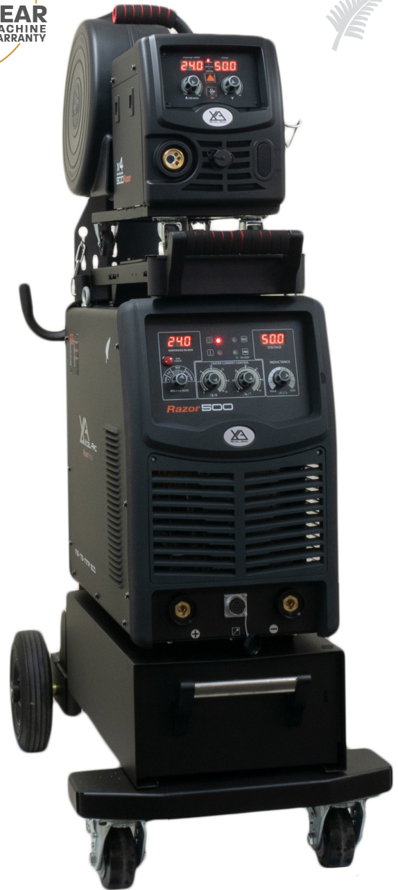
Optional machine accessories, Spool Guns, Push Pull Torches, Tig Torch Kits available - refer page 38-43

Standard Package includes: MIG500RZSWF Welding Machine, 4 Roll Separate Wire Feeder with 10m Interconnecting Cables, Trolley with Drawer, XA38 Mig Torch x 4m, Earth Lead & Arc Lead x 5m, Argon Regulator