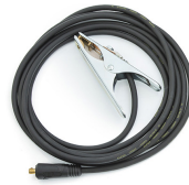
Earth return cable 5 m, 25 mm 2