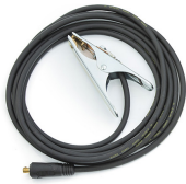
Earth return cable 10 m, 25 mm 2